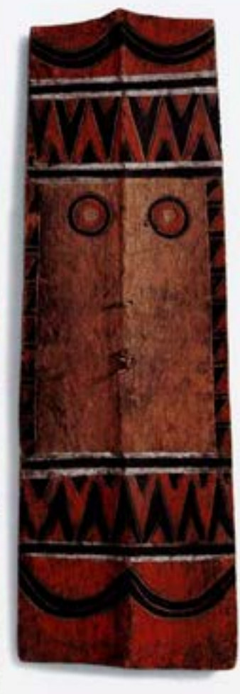
Fig. 5: Shield, senapu. Lembata, Lamatukang. Painted wood. 110 x 32 cm cat. no. 1094. N.S. 28062a.